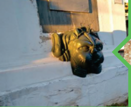
Hurling Swing Pump Gardens