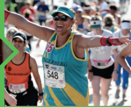
Pentz Street Bo-Kaap (Koesiester Hill)