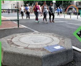
Slave Tree Plaque Spin Street