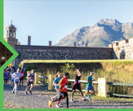
Castle of Good Hope