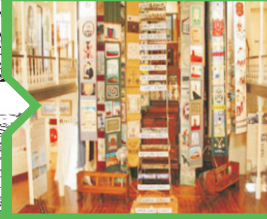
District 6 Museum