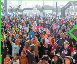
Grand Parade - Finish