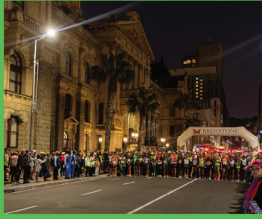
City Hall - Start