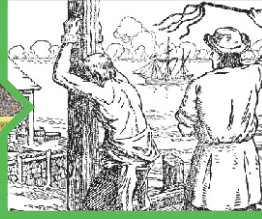
Whipping Post Grand Parade cnr. Darling & Buitenkant Street