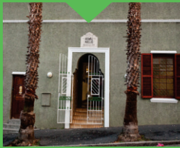
Auwal Mosque Dorp Street