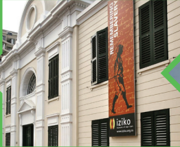
Iziko Museum Slave Lodge