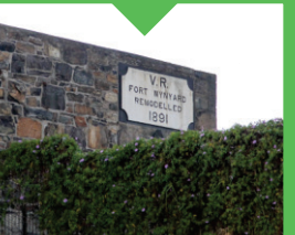
Fort Wynyard Green Point