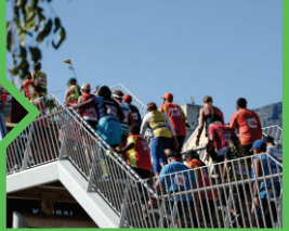
Fan Walk Green Point