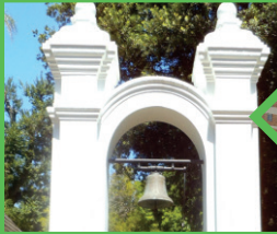
Slave Bell Company Gardens