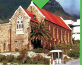
St Marks Church District 6