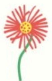
Athletics Gauteng North

VENUE: Voortrekker Monument, Eeufees Rd, PTA